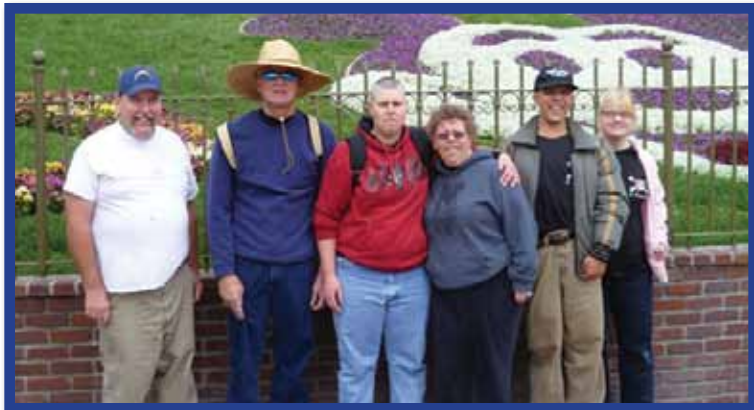
Everyone loves Disneyland, but no one more than the residents of Noah Homes.