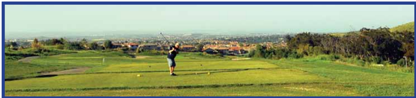
A beautiful day to tee off.