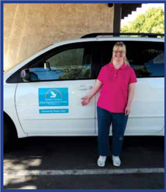
Pinkee displays the new Noah van.