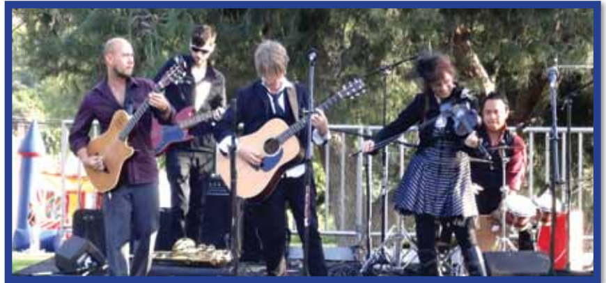
Skelpin performs outstanding Irish tunes.